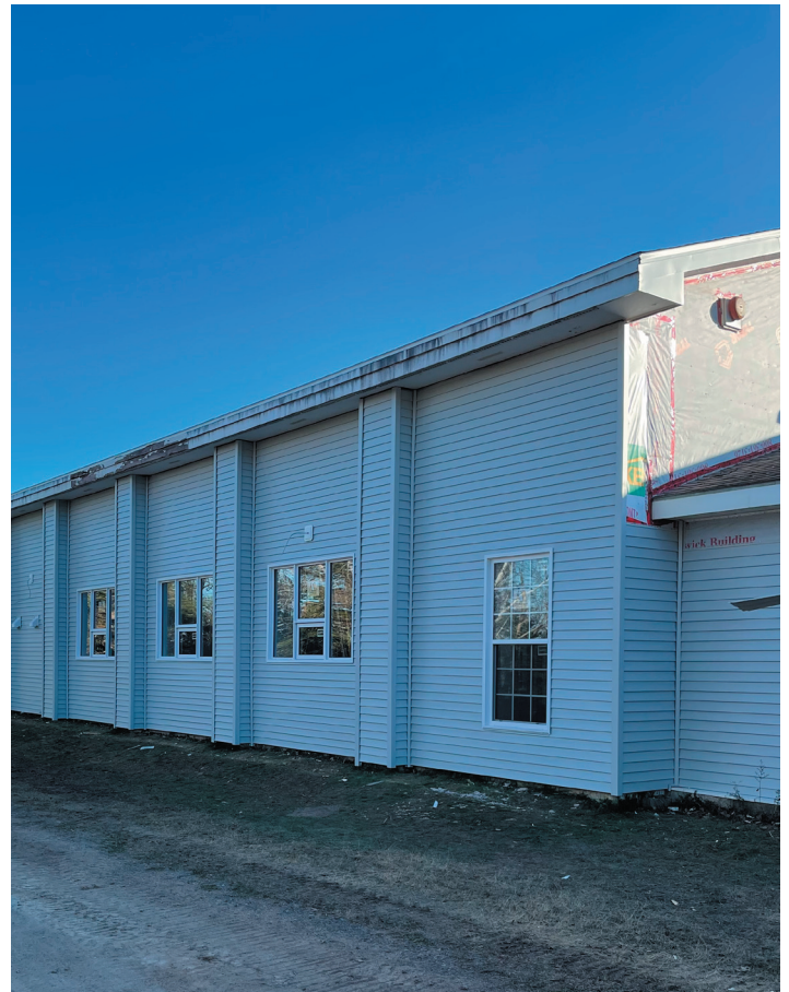
Top left: Rear of sanctuary, Bottom left: Front of sanctuary. Top right: Outside siding,