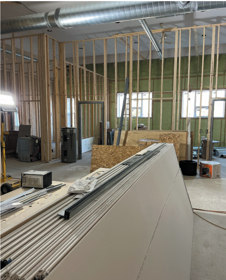
Top left: Looking out to the entrance.