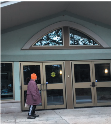
A client waiting to enter the Salvation Army and register for a Christmas Hamper.