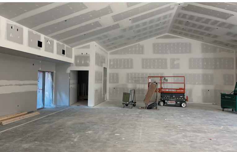
Top left: Rear of sanctuary.