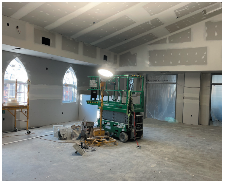
Bottom left: Front of sanctuary.