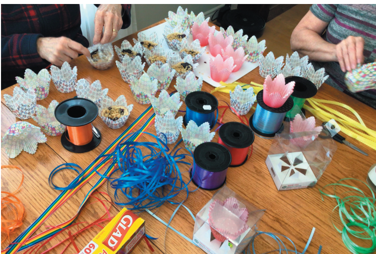
Many hands made light work in the packaging as well as the baking of the apple pies.