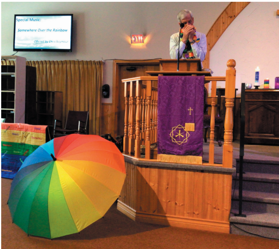
Chris Seymour played "Somewhere Over the Rainbow" during the PIE Day service.