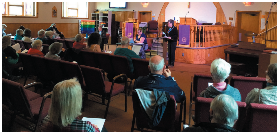
The congregation voted overwhelmingly to become an Affirming congregation at the AGM.

The Affirming Committee is grateful for the interest, support and encouragement we have received from Orchard Valley members since our first meeting in April 2019. We continued to meet regularly, via Zoom, through two years of COVID restrictions. We will remain active on this committee, trusting that we will continue to learn and to grow into an ever stronger, inclusive, sincerely welcoming, community of faith.